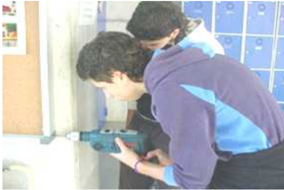
Technology Repair Workshop