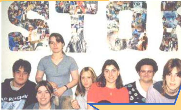
Non Violence Col.lage