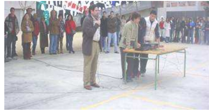
Technology Technical Support in scholar events