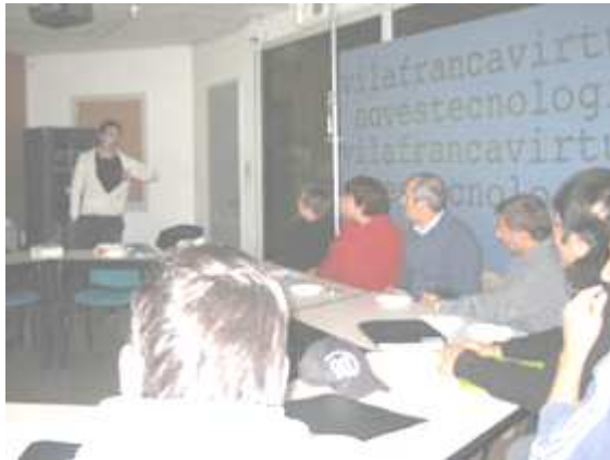
Public presentations of the own work and personal experience